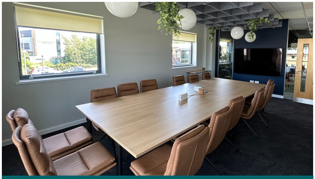
Boardroom Seating - 14 | Classroom Seating - 16 | Theater Seating - 30