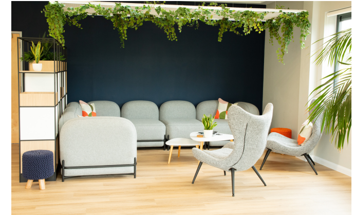
Cosy Sofa Area