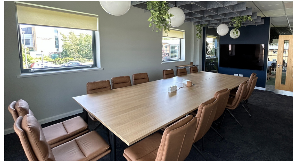
Boardroom Seating - 14 | Classroom Seating - 16 | Theater Seating - 30