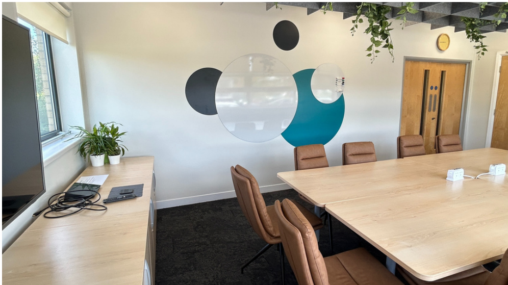
Boardroom Seating - 12 | Classroom Seating - 10 | Theater Seating - 24